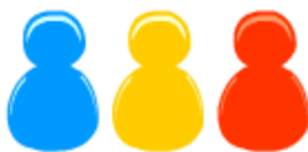
a place marker for each player

You can use buttons or pawns as markers.