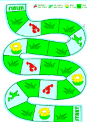
a game board